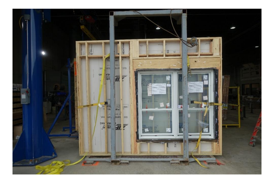
Wall panel at the factory with window installed. Note gray shipping frame.