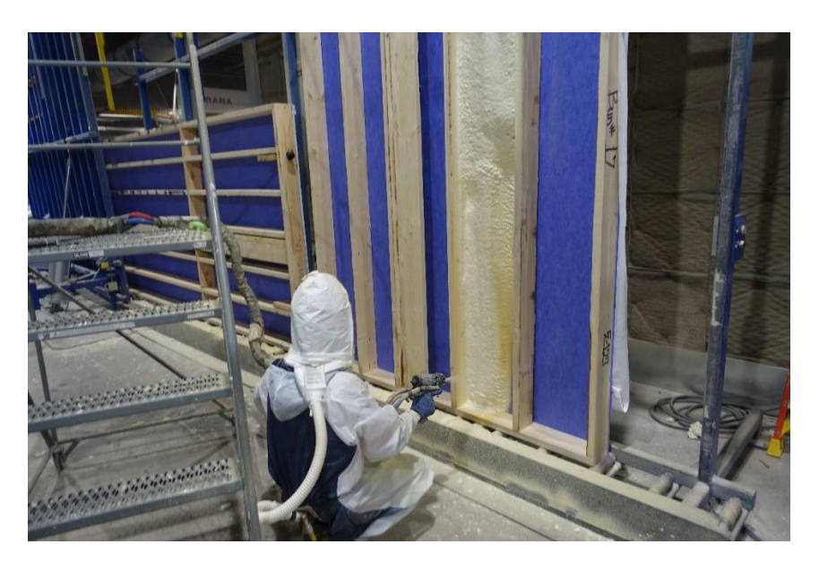
Spray foam application at the factory

Spray foam is not widely utilized in this market but remains one of the most cost- effective ways to improve building performance in Minnesota's climate. Spray foam is applied to the wall panels in the factory allowing for a climate and air-controlled environment. 2 ½" of spray foam equates to an R value of 17.50 and acts as a vapor retarder.