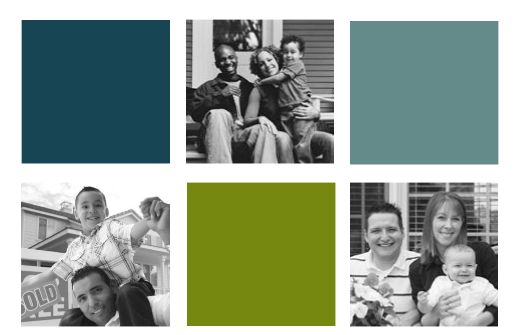
Planning, Research & Evaluation