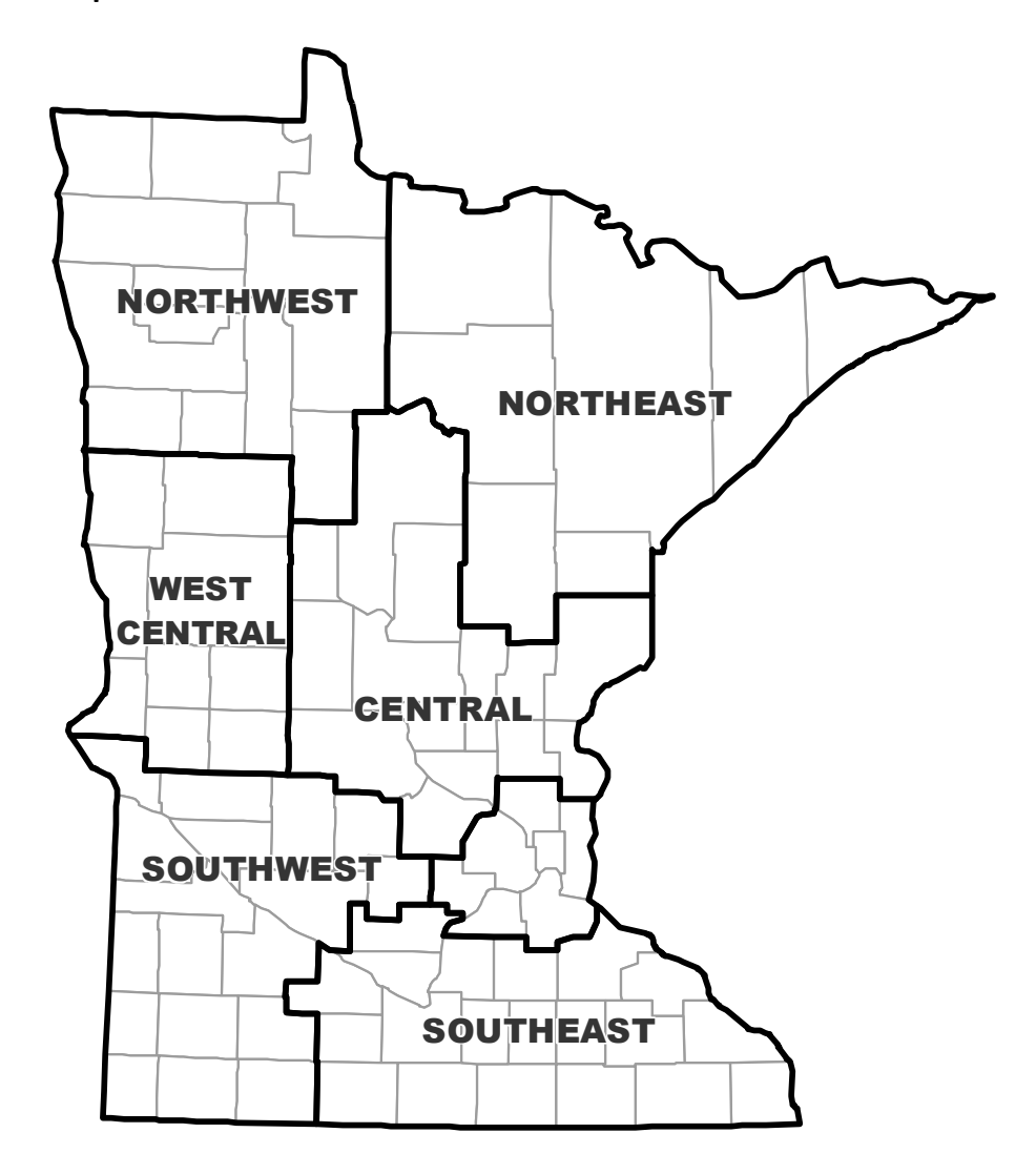
Map 1: Regional Map